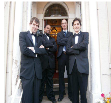
The name's Bond, James Bond

During the summer months there have been times of celebration and joy for many..May balls and graduation ceremonies give a fantastic opportunity to dress up and to escape briefly from the pressures of studies.