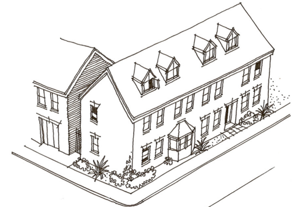
Artist's impression of the new house

We will be sharing more about our plans for this new build at our Annual Open Meeting (details on the back) and we hope to have a launch for this project later in the year. We will also be providing further information in future Link News but see attached flyer for ways to be involved now.